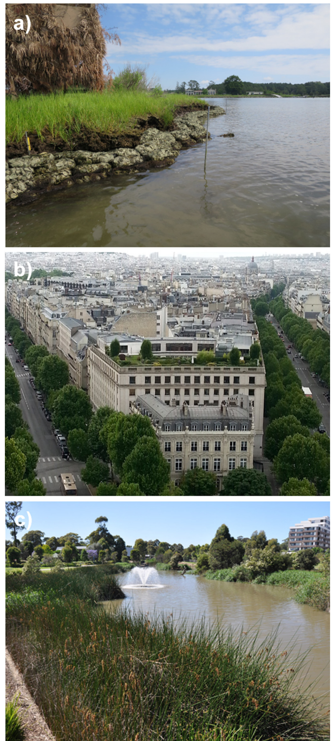
Fig. 1. Examples of multi-functional, multi-realm infrastructure initiatives: a) Living shorelines (Chesapeake Bay, Virginia, US), b) Green roofs (Paris, France) and c) Artificial wetlands (Sydney, Australia). (For interpretation of the references to colour in this figure legend, the reader is referred to the web version of this article.)

a) Living shorelines provide stabilisation and protection for coastal cities, which are increasingly threatened by rising sea-levels and increases in storm surges (McInnes et al., 2003). The construction of hard structures such as seawalls, revetments and breakwaters have historically been the standard approach to coastal protection, but these can cause significant ecological damage and often disrupt important connections between the terrestrial and marine realms (Bishop et al., 2017). Living shorelines, are designed as a substitute or a complement to traditional artificial coastal defence structures using natural habitats, such as mangroves or dunes (Fig. 1a). For example, successes in restoring functioning mangrove ecosystems in the urban setting can be seen in Australia (e.g. Moreton Bay, Gold Coast (Lovelock et al., 2019)) and Fiji (e.g. Laucala Bay, Suva (Greenhalgh et al., 2018)). Managing such coastal and marine ecosystems can provide services including enhanced water quality (Needles et al., 2015), habitat provision, fishery enhancement, nutrient